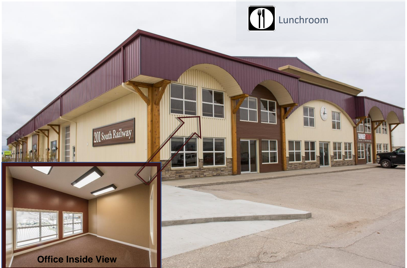
Office Inside View