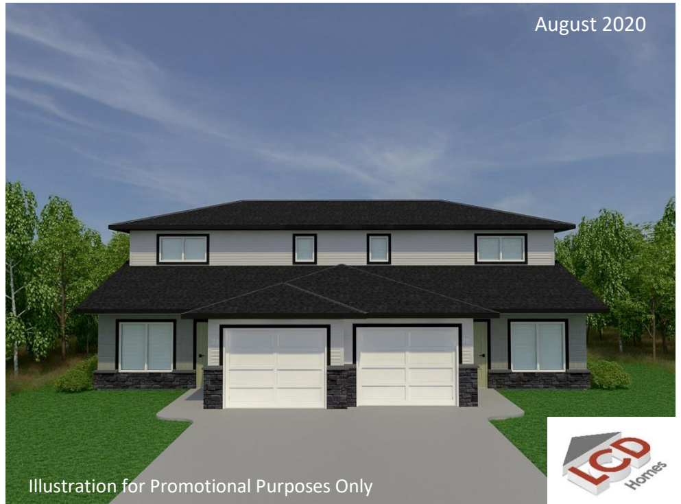
Illustration for Promotional Purposes Only