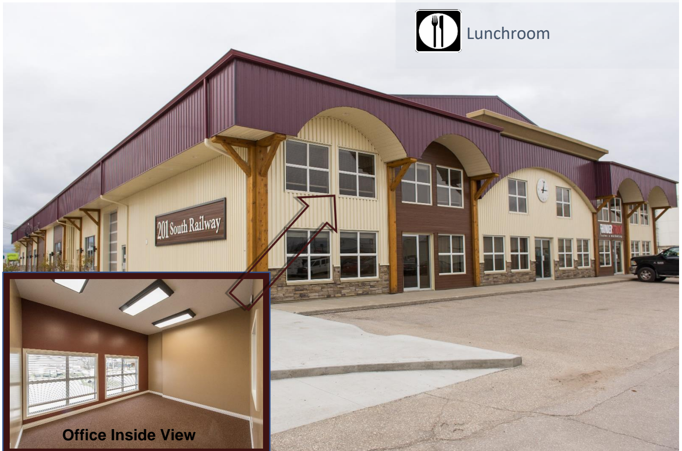
Office Inside View