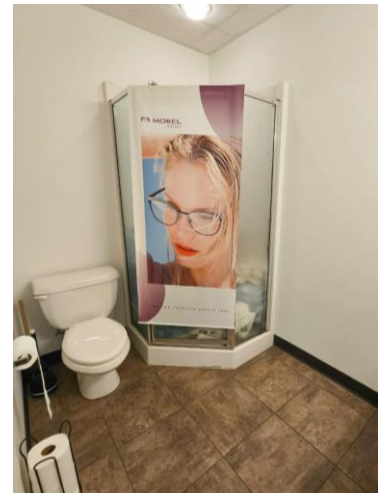
3 offices (2 offices could easily be converted back to 1) and one 3 pc washroom