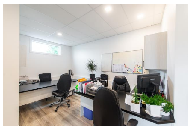
Office 3 & 4